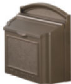
French Bronze Item # 16012