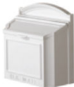
White Item #16013