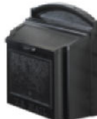
Black Item #16022