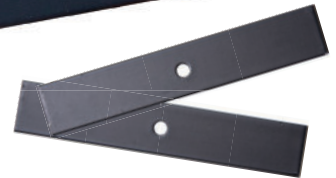
(2 screws/2 nuts are included with the straps)