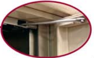
Stainless steel hold open door catch on each side of master gate