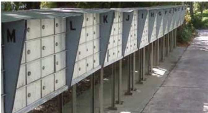
Obsolete NDCBUs are no longer permitted for replacement or new installations.

installation, or create a standalone package center. Florence is proud to be the only USPS Approved manufacturer of the OPL, ensuring the Postal Service can always deliver the packages you or your customers are waiting for the very first time! (see page 8 for product details)