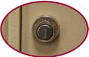
Heavy-duty tenant cam lock with three keys