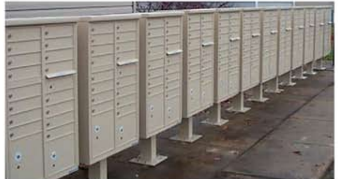
New CBUs accommodate both mail and packages while providing greater security.