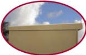
Sloped top for moisture runoff