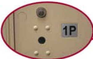
Fully Integrated parcel locker(s) with key trapping lock