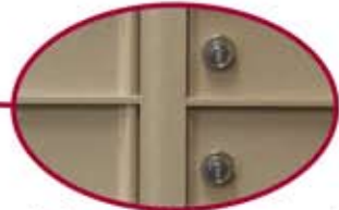
Interlocking, overlapping seams and tight clearances to prevent prying