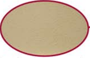
Rugged, weather-resistant powder coat finish in four architectural colors