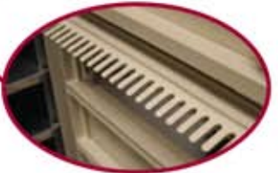
Aluminum comb prevents mail fishing in outgoing mail collection compartment