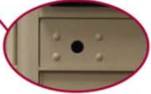
Convenient solid aluminum integrated outgoing mail collection compartment prepped for USPS Arrow Lock