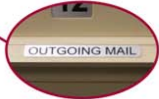
Integrated Outgoing Mail Slot with weather protection hood