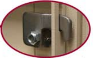
Heavy duty cam latches through frame for added security