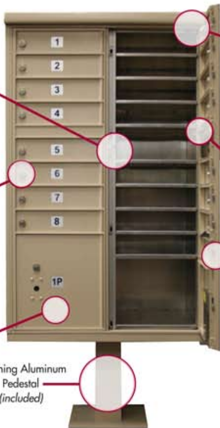
Matching Aluminum Pedestal (included)