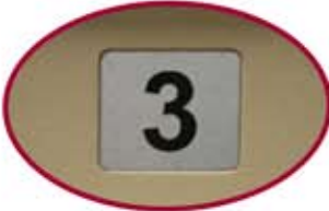
Standard silver adhesive identification decals contain up to five characters (engraving optional)