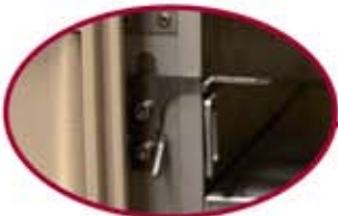
Easy release handle to open master gate